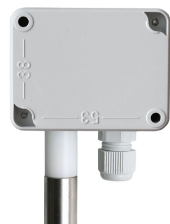
Fig. 2 Rear view with dimensioning of openings for mounting